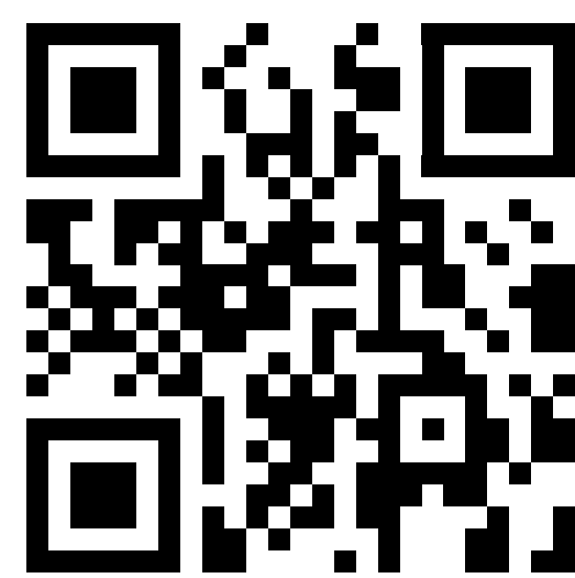
Fig. 2: Listen to Dan.